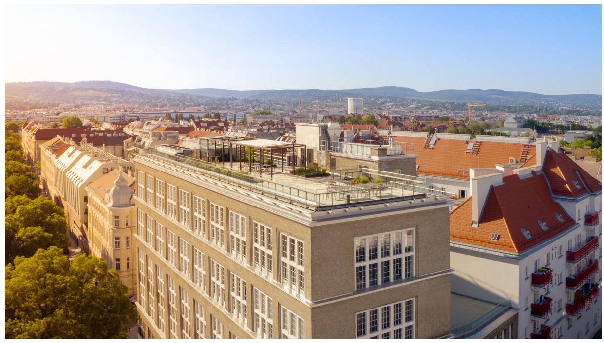
LEWITT headquarters in Vienna, Austria